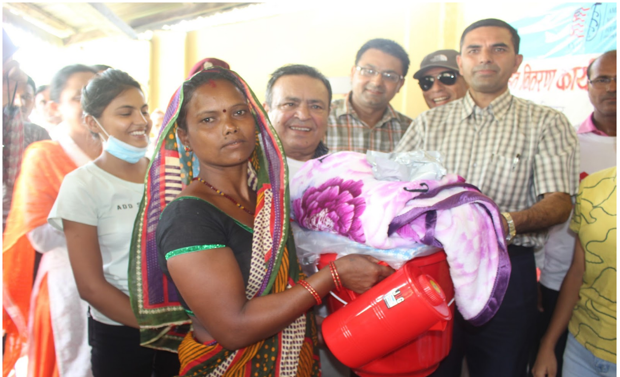
Chief District Officer Morang on Relief Distribution