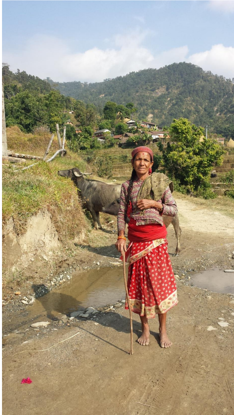
View from Health Center