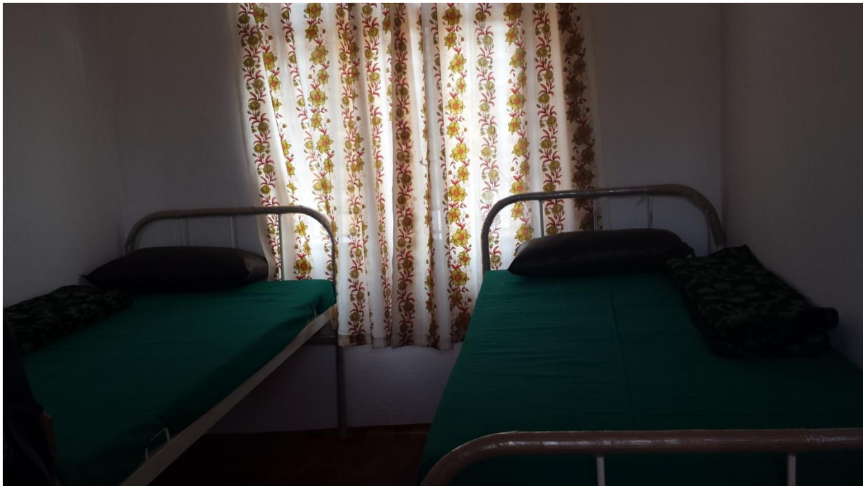
Patient Room #2