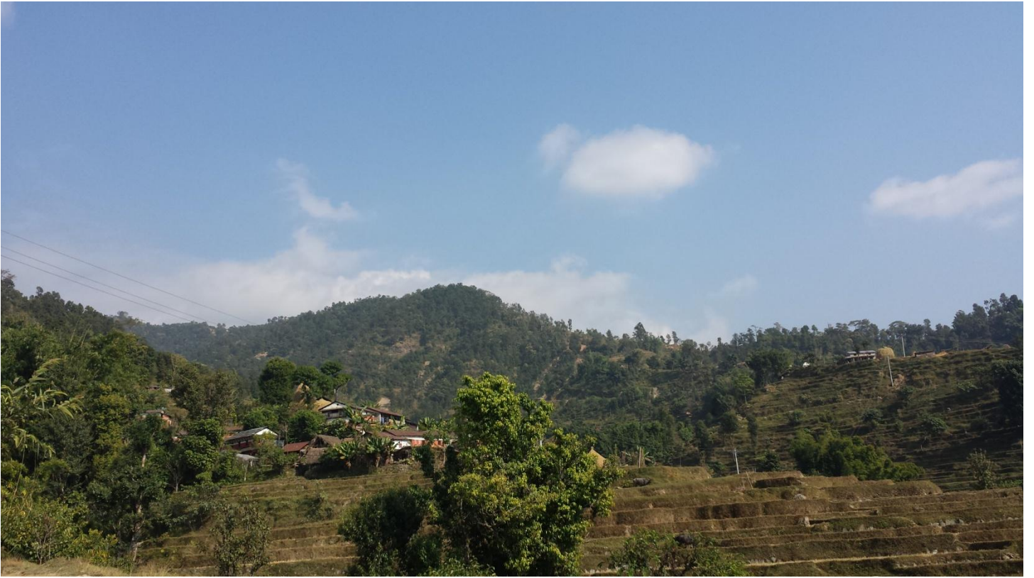
View from Health Center