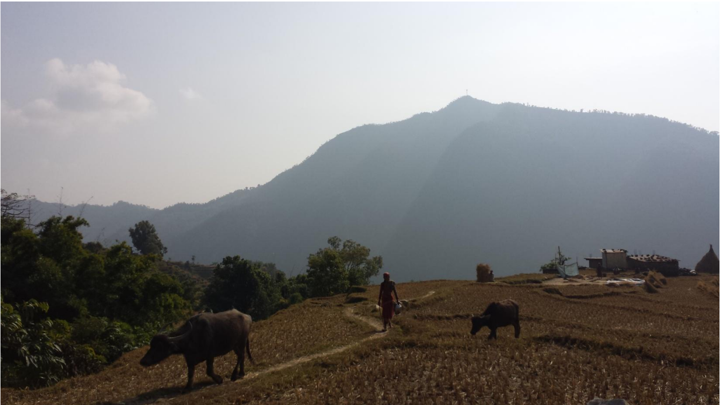
View from Health Center