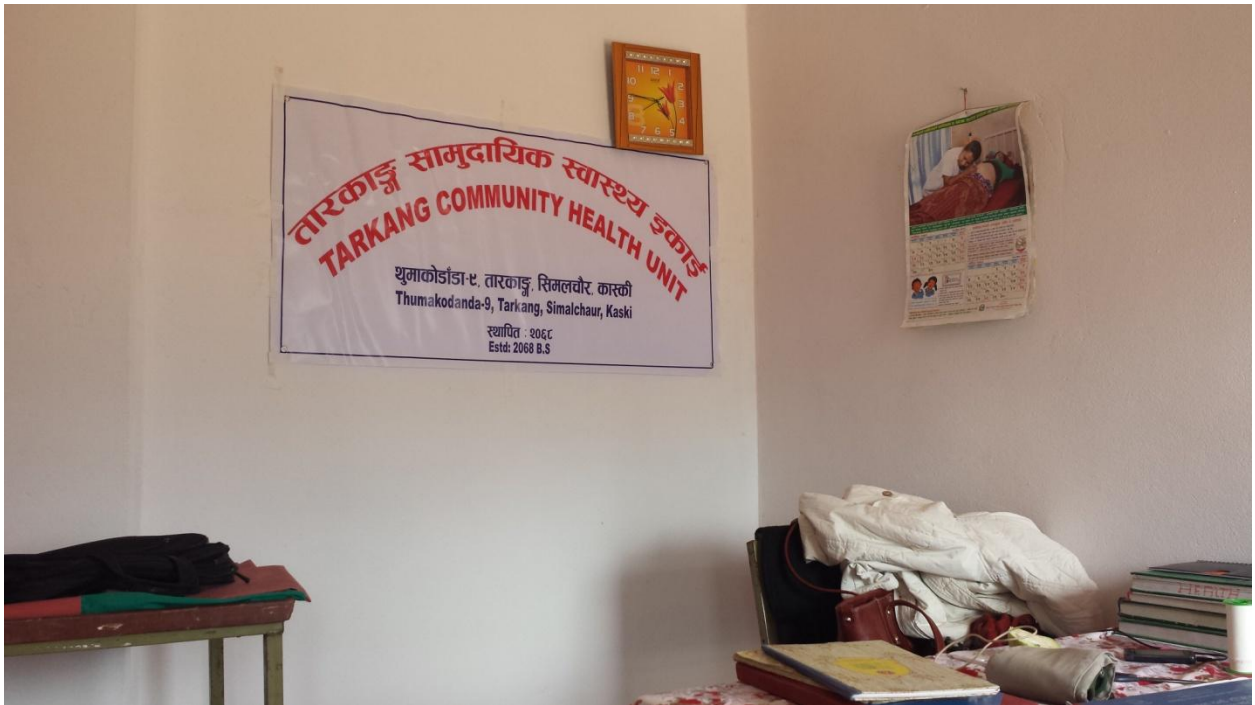
Office – Registration Room