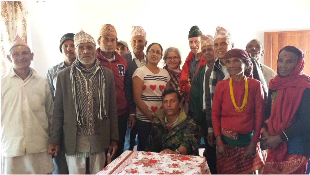
Warm welcome from Tarkang community members