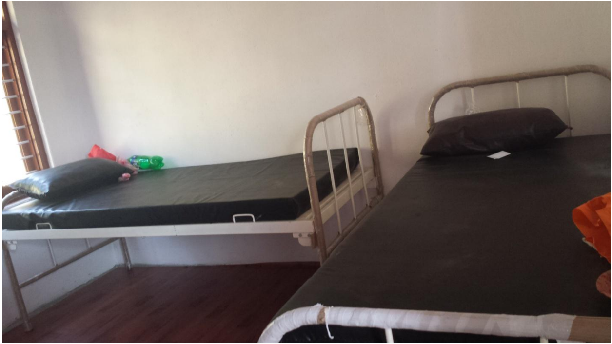
Patient Room #1