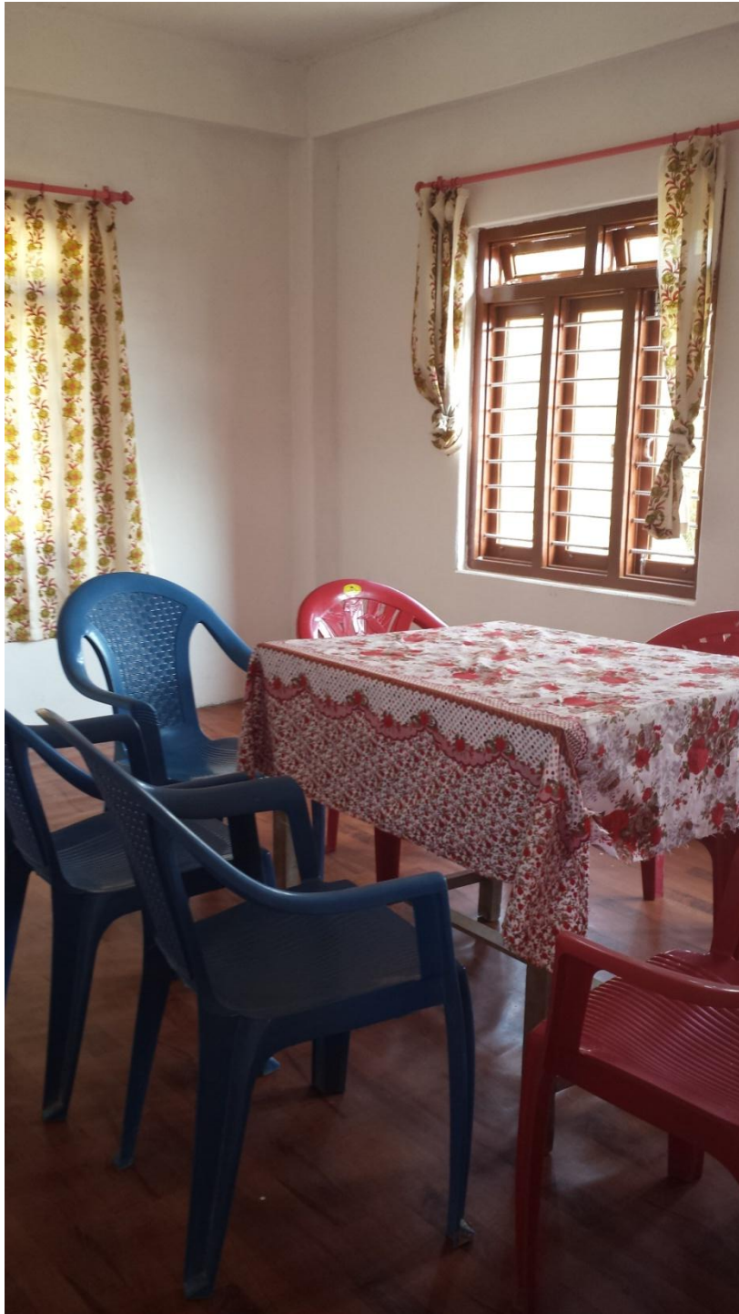
Dining and common room