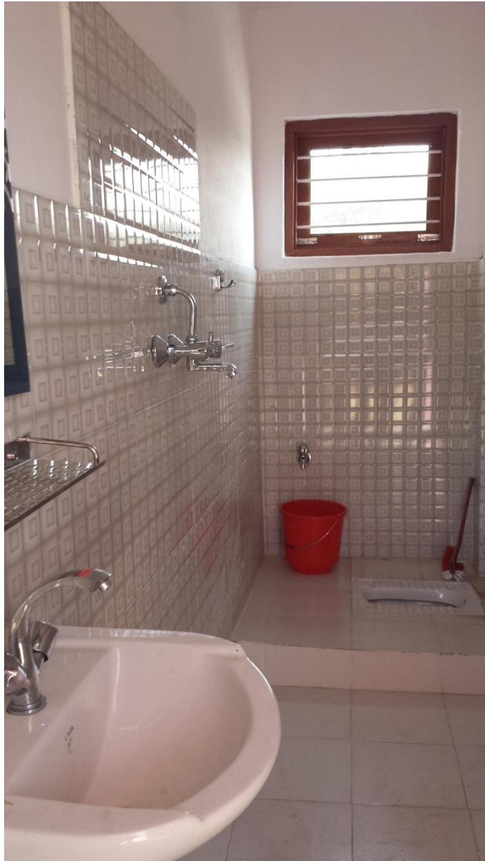
There are two rest rooms like this