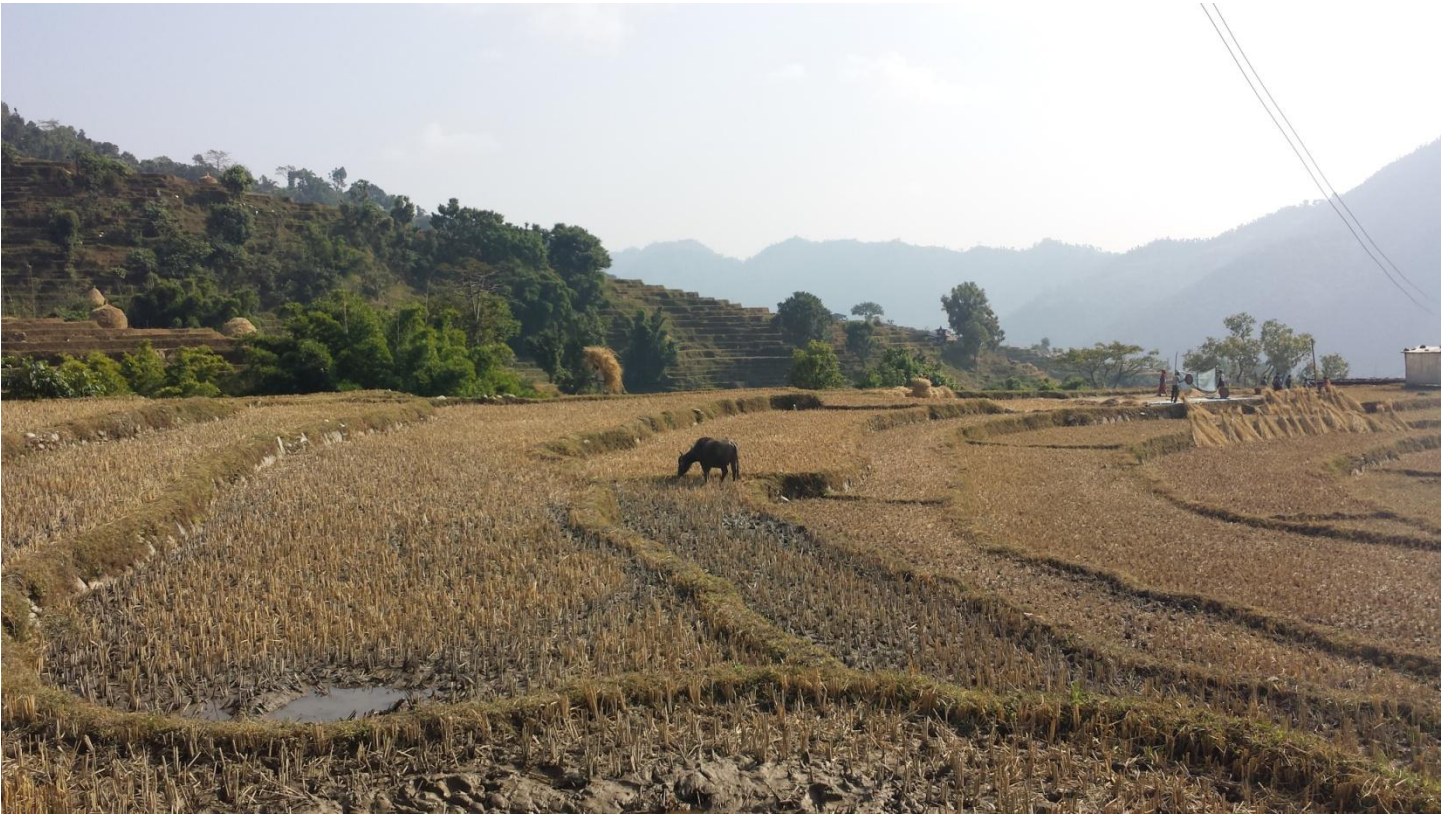
View from Health Center