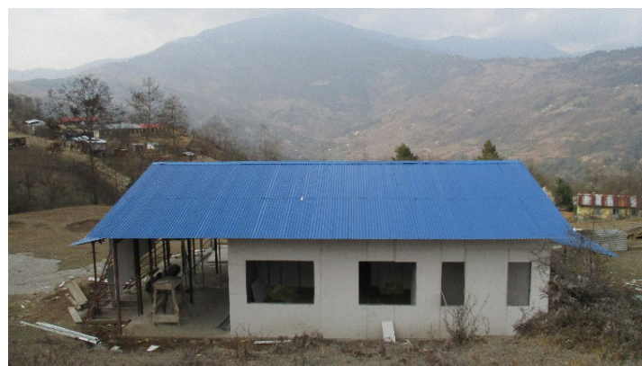
ONGOING PREFAB INSTALLATION IN MALI HP