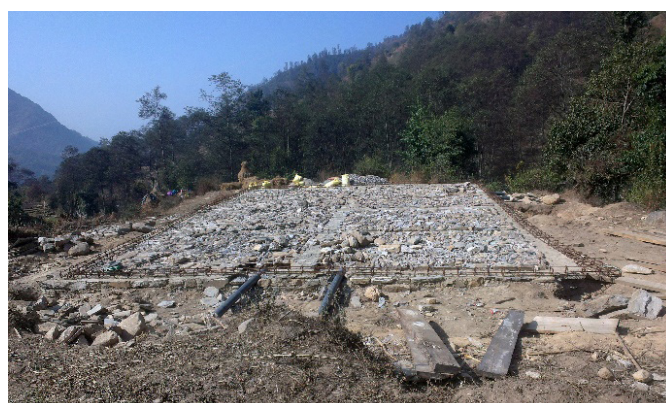
BHUSAFEDA HP JUST BEFORE THE PLACEMENT OF POSTS