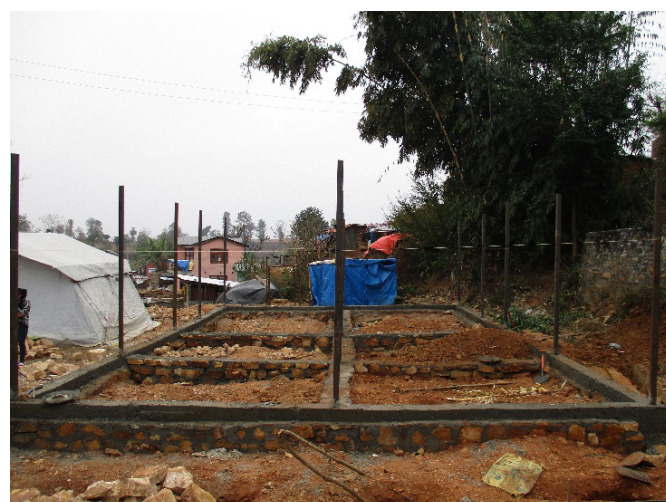
NAMDU HP AFTER THE PLACEMENT OF POSTS