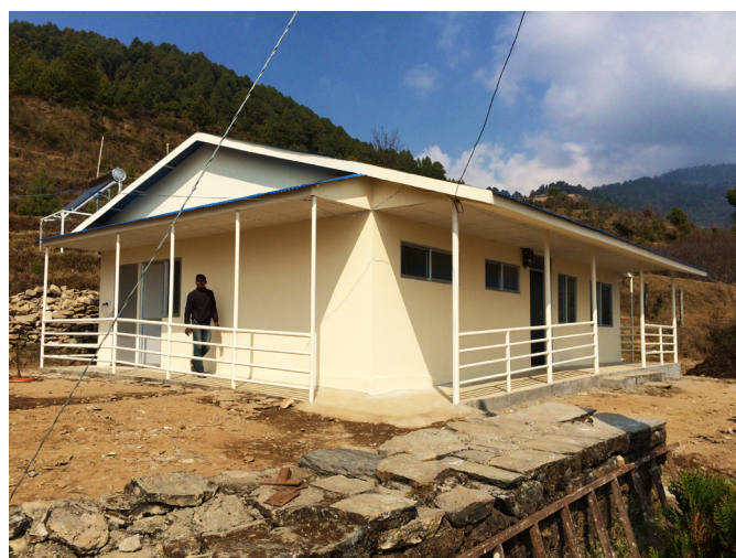
THE NEWLY CONSTRUCTED BOCH HP BUILDING